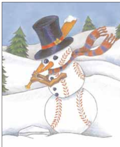
One of several holiday card designs to be found at Everything Baseball

If you can imagine it, chances are you can find it. Visit http://everythingbaseballcatalog.com to find out.