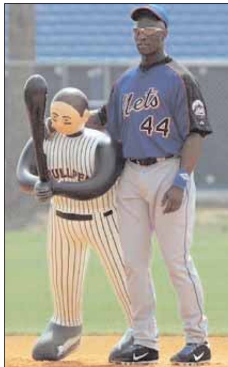
Bullpen Buddy is used by teams from youth leagues to the big leagues, including the Mets

Most pitching coaches agree that developing control and command are integral elements to building confidence and success in a young pitcher, and the Bullpen Buddy can accelerate the pitcher's feel for the strike zone and increase his ability to pick the proper placement of his or her pitches.