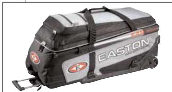
Easton Stealth Sled was created with help from Ogio, a leader in bag design and innovation

With a telescoping, reinforced pull handle