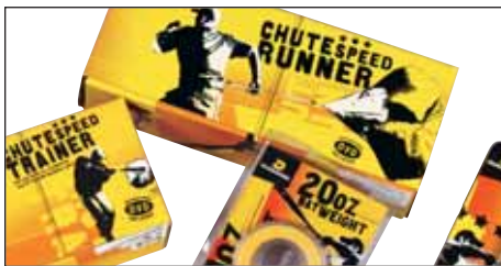
Look for the Chute Speed Trainer, the Chute Speed Runner and accessories